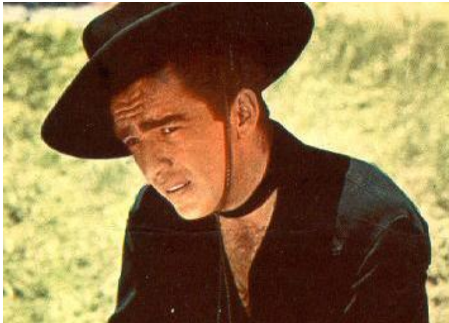
Lash LaRue, "the original man in black"

Three loyal fans (Waylon Jennings, Willie Nelson and Johnny Cash) gave Lash a bit part in their 1986 made-for-television remake of "Stagecoach". Probably a sartorial influence on Johnny Cash, Johnny introduced Lash to his family as "the original man in black". LaRue even gave lessons to Harrison Ford on how to use the bullwhip for the "Indiana Jones" movies. And Quentin Tarantino's "Pulp Fiction" has this bit of dialogue: "How about you, Lash LaRue? Can you keep your spurs from jingling and jangling?"