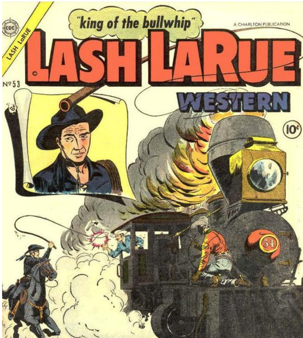
"King of the Bullwhip" in the comics