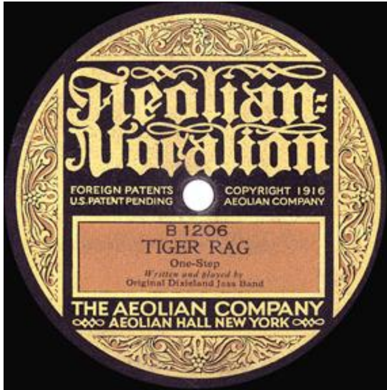
1917 recording of Tiger Rag by the "Original Dixieland jass Band"