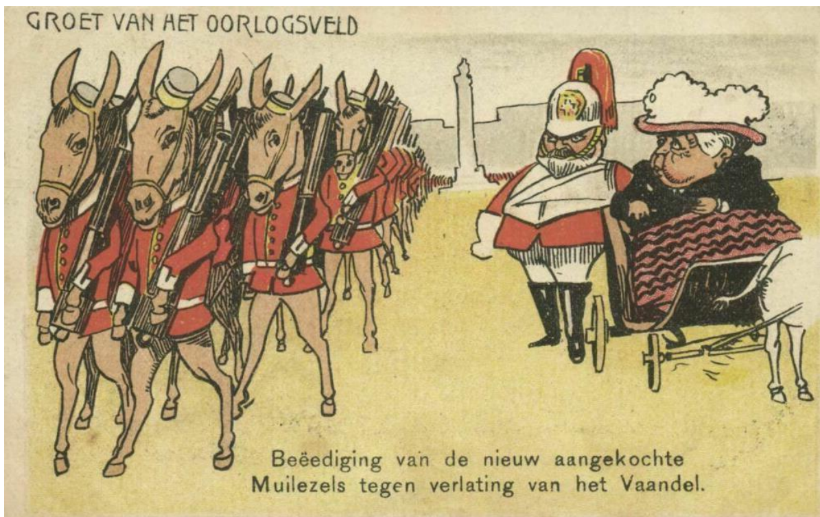
Caricature of Queen Victoria, inspecting new mules for the Boer War

The New York Times article continues with commentary on this offspring of a male donkey and a female horse: “the most valuable, are called the ‘sugar’ mules, deriving their name from the fact that they are well adapted to haul the huge wagons that are used on the plantations of Louisiana. To be classified as a sugar mule the animal must be from 15 ½ hands high to 16 hands 1 inch, and must weigh from 1,000 to 1,400 pounds.” The Army, however, used only the “cotton” mules (“13 to 15 hands high” and “600 to 900 pounds”).