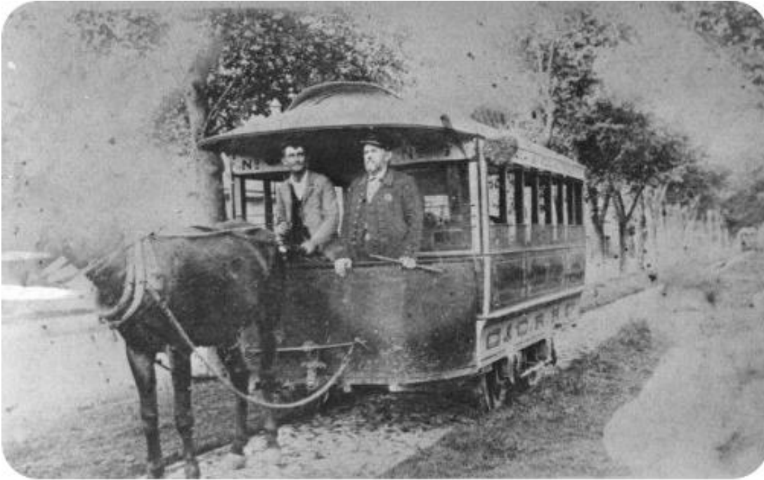
Mule drawn streetcar in New Orleans

As for the street vendors, a few still remember them. Dr. John (Mac Rebennack) in his autobiographical "Under a Hoodoo Moon" recalls: