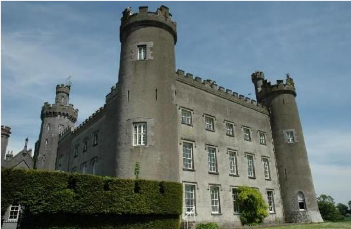
Ireland's Tullynally Castle

Tullynally Castle is an impressive Gothic Revival Style castle located some two kilometers from the pretty village of Castlepollard on the Coole village road in County Westmeath, Ireland. Tullynally (the name, literally translated, means "Hill of the Swans") has been home to the same family (ten generations) for over three and one-half centuries, and over the years the structure of the house has undergone great alterations. The embellishments made in the 1860s were enough to see the home allocated the position as the largest occupied castellated country house in all of Ireland.