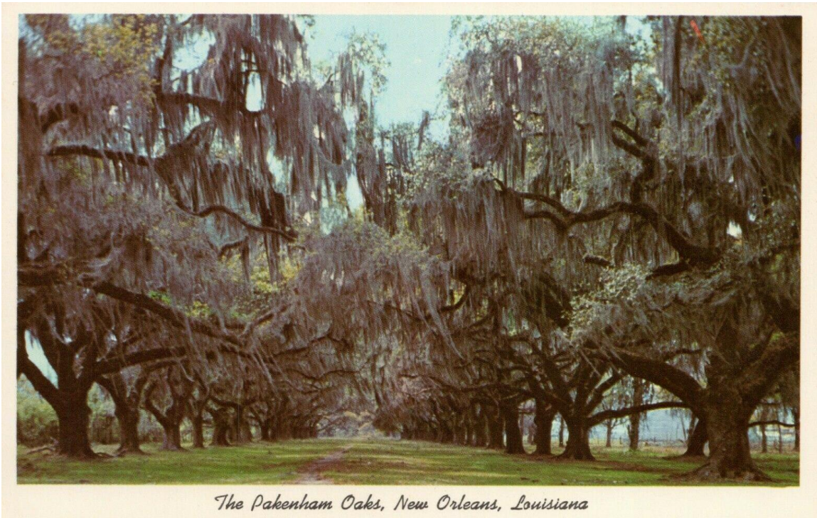
Pakenham Oaks, postcard scene