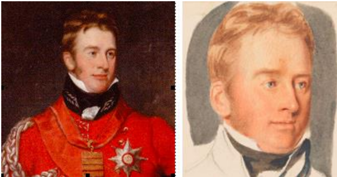
Sir Edward Michael Pakenham GCB, in two separate paintings

Edward Pakenham (known as Ned) had a sister, Catherine (known as Kitty), who in 1806 married Arthur Wellesley, the future Duke of Wellington. Ned was one of the young men with ability that the "Iron Duke" had picked for his staff. Pakenham's family had purchased his commission as a lieutenant in the 92nd Foot Regiment when he was only sixteen. A very capable leader, he commanded a battalion of Royal Fusiliers at the tender age of 19. Victory was achieved against the French at Martinique, where Pakenham was among the wounded. According to the Fusiliers' history, "He was to be wounded again three times in the Peninsular War before he fell at the head of the brigade, which included his old battalion, at the disastrous attack on New Orleans."