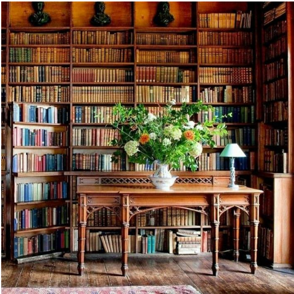
Another impressive interior view of Tullynally Castle

Antonia Fraser wrote of the assassin, "He had gone for Hugh, it was said later, as a hard-line Tory over Northern Ireland - which wasn't even true: as a Catholic himself, Hugh had a lot of sympathy for the plight of the Catholics over there."