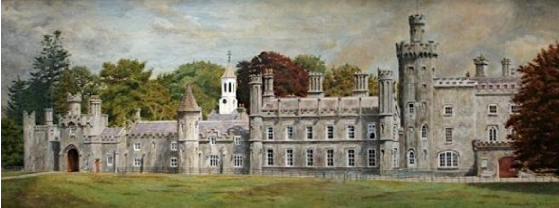
The long faux castle, appearing to be every bit the miniature village

Between 1801 and 1806, the once Georgian home was transformed into a faux-castle by pre-eminent Irish architect Francis Johnston. The gray-stone structure is so long, with its 600 feet of battlements and numerous towers, that it looks like a miniature town from a distance.