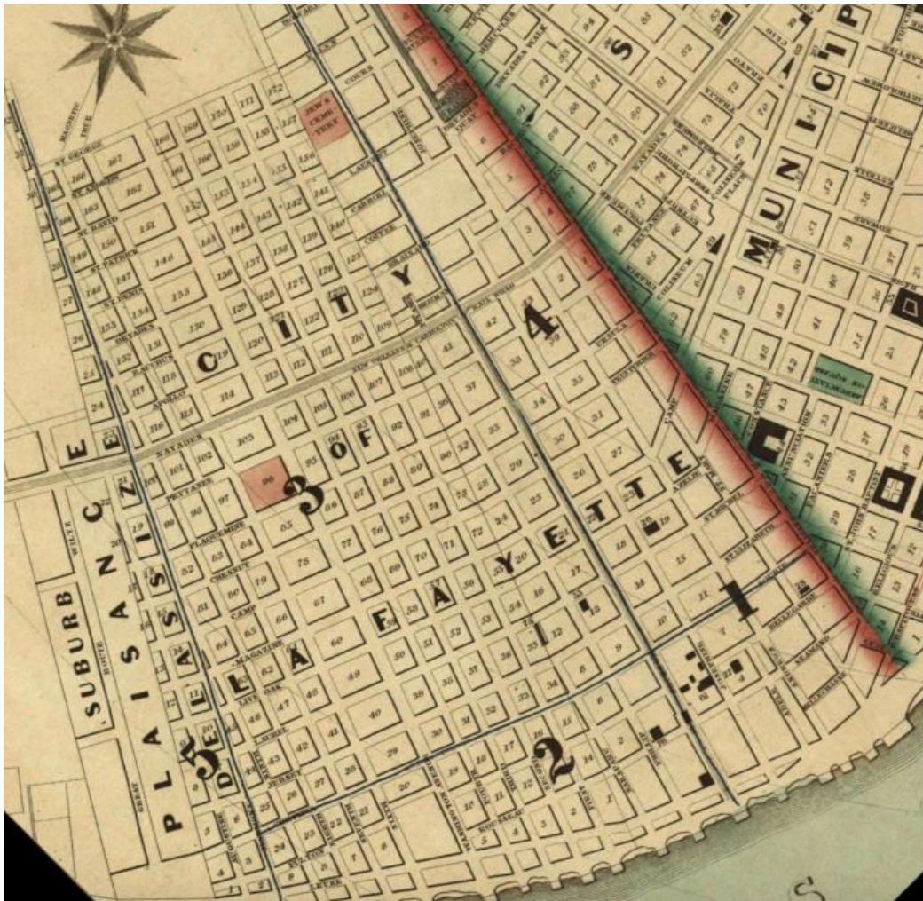
City of Lafayette, from Norman's Plan of New Orleans and Environs, 1845

The mission of the Ursulines, sent to New Orleans by Louis XV, was to establish a hospital for poor sick persons and to provide an education for young girls of wealthy families. One notable alumna was the Baroness Pontalba. And yet the nuns understood their purpose was to educate Native American and African-American girls, as well. The Ursulines also worked in health care and established an orphanage, with Sister Francis Xavier as the first woman pharmacist in the New World. They continue today to educate girls and young women of New Orleans.