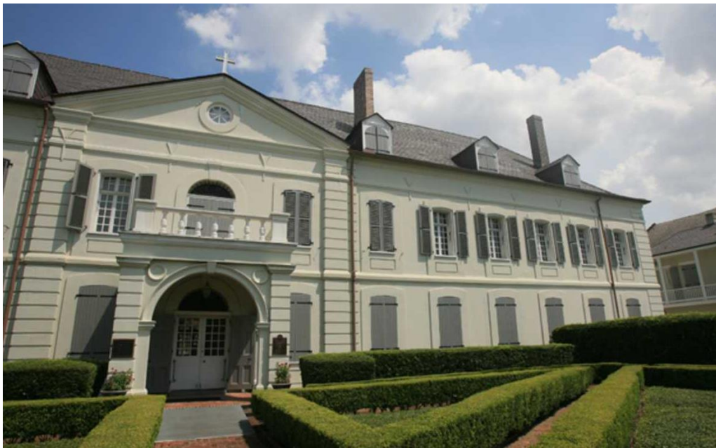
The Old Ursuline Convent in New Orleans

It all begins with the Ursulines, a Roman Catholic religious order for women founded as the Company of St. Ursula in the 1500s by Saint Angela de Merici. The order's primary aim was the education of girls and the care of the sick and needy. In the following century, the Ursuline Sisters were the first Catholic nuns to land in the new world. In 1639, Marie Guyart (who took the name Marie de l'Incarnation ) and two other Ursulines arrived in Canada. Almost ninety years later, fourteen French Ursuline sisters landed in New Orleans in 1727, the first nuns in what is now the United States.