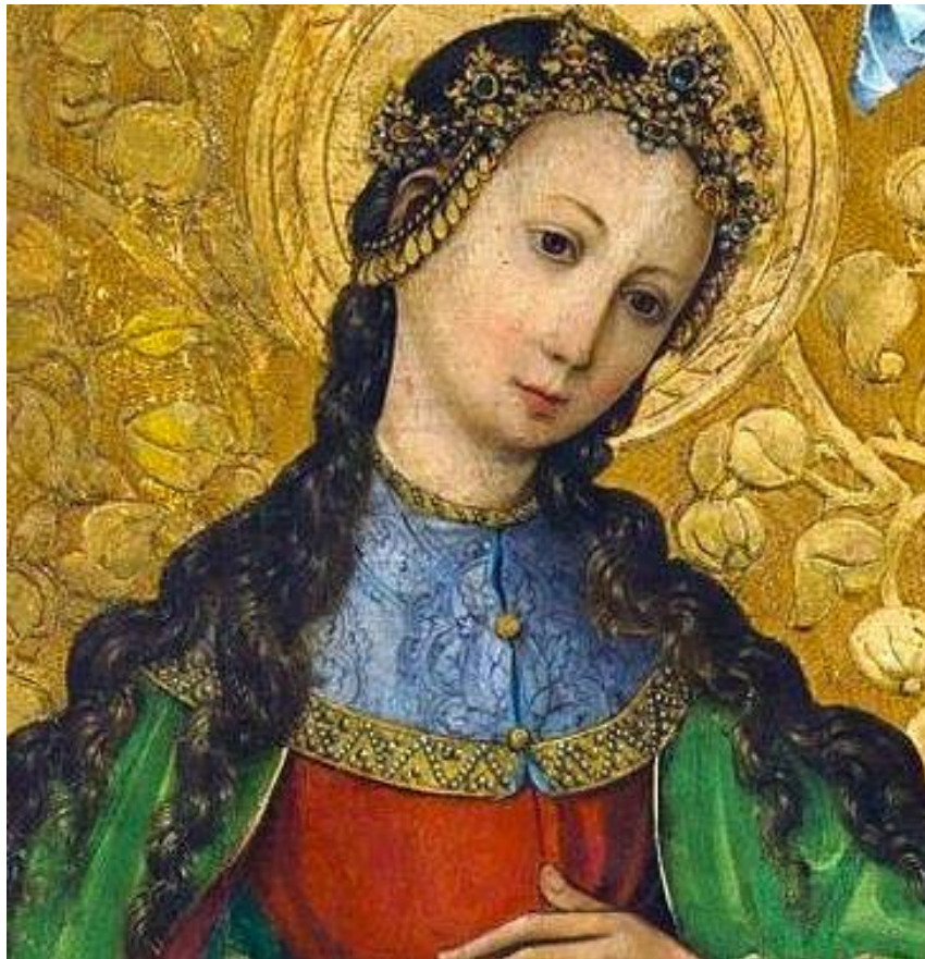
St. Felicitas of Rome (Sainte Félicité) painted circa 1520, National Museum in Warsaw, Poland Patron saint of parents who have lost a child in death, her feast day is November 23rd.

Faubourg Religieuses was bounded above by St. Andrew Street and below by Felicity (with St. Mary in the middle). The Ursuline nuns, after deciding not to build a new convent on the site, enlisted Lafon to make a plan of subdivision on September 18, 1810, opening up lots for purchase. By an act of the Legislature dated April 1, 1833, the Faubourgs Religieuses , Lafayette and Livaudais were separated from the City of New Orleans and formed into a distinct corporation called the City of Lafayette, thus narrowing the limits of New Orleans. The City of New Orleans' upper line was at that time Felicity Street with its lower boundary being the Canal des Pêcheurs (an earlier name for Canal Street).