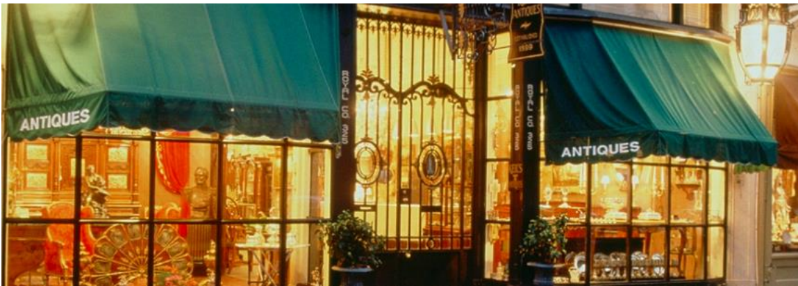
Keil's Antiques, 325 Royal Street in the French Quarter

The antiques business in the Crescent City began after the Civil War, when old families were short of cash and were in desperate need of it. People borrowed by pledging their belongings to pawnbrokers and second-hand stores. There were also rag-and-bone men (the recyclers of their day) for the smaller items.