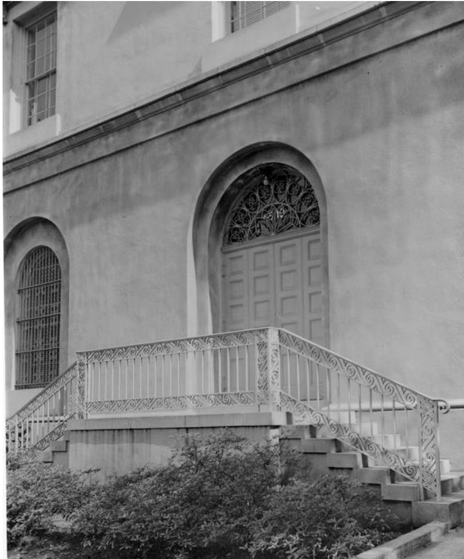
Shown above are the front stairs and entrance to the Jackson Exchange at the corner of St. Charles Avenue and General Pershing.