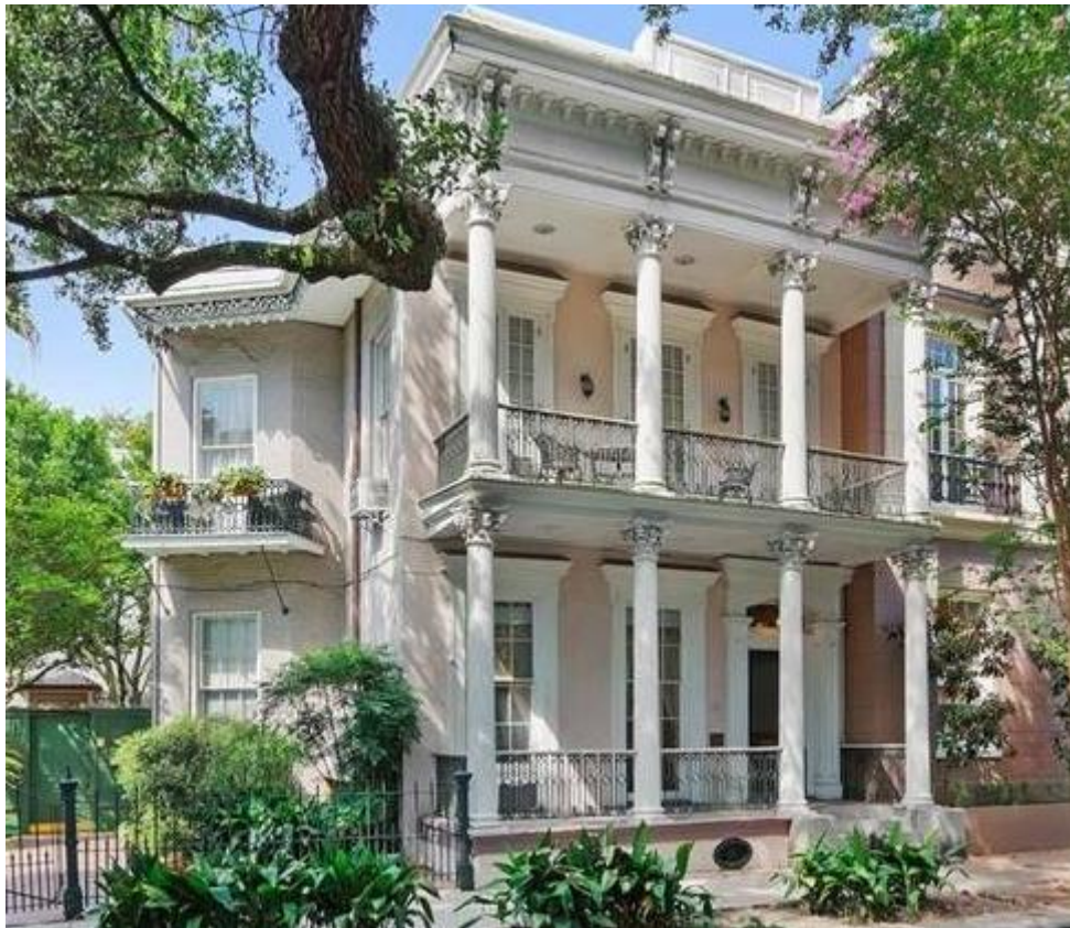
1016 Esplanade today, once the site of the Hemlock Exchange

Stanley Clisby Arthur (1881 – 1963), a writer who dedicated much of his life to documenting the customs, culture and history of New Orleans, once wrote of a stately structure at 1016 Esplanade Avenue with the appearance of a feudal castle. Built in 1838 by Sampson Blossman, the building had also been home to Edward Pilsbury, once Mayor of New Orleans, among others. But the most unusual purpose for this intriguing edifice was that it once housed the Hemlock Exchange of New Orleans' early telephone company.