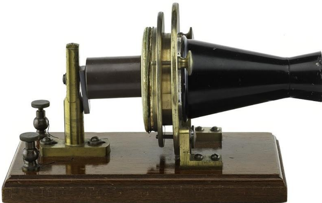
Bell's 1876 telephone

“History tells us that, as early as 1667, Robert Hooke made sound travel along a stretched wire. Philip Reis of Frankfort, Germany, produced an electric telephone in 1861. In 1876, two telephones were patented; one by Elisha Gray, the other, by Alexander Graham Bell. These two men, unknown to each other, applied on the same day at the Washington office for their patents. Bell’s proved the better instrument, and with many improvements is still in use. Thomas Edison has given us one of the most important things in the telephone – the carbon transmitter”.