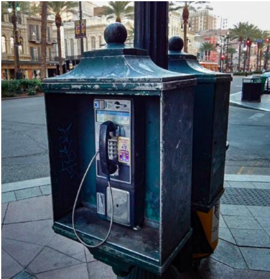
Old pay phone on Canal Street in New Orleans

Each bygone exchange from New Orleans has its special memories, too. This author’s past telephone number was EVergreen 6609 (out by the Lake), and he once had a CHestnut number for his office in New Orleans East. The FRanklin Exchange replaced Hemlock in 1926, and RAYmond came along in 1928. There was CRescent, AUdubon, MAgnolia, BYwater, CRescent, AMherst, VALley, TEmple, TYler, VIctor and CANal. On June 21, 1948, the UNiversity Exchange was introduced uptown (all those 865 and 866 numbers). 1951 saw EDison hit the Westbank, and 1952 brought the Eastbank TULane, FAirview and EVergreen. Then came FOrest and FILLmore.