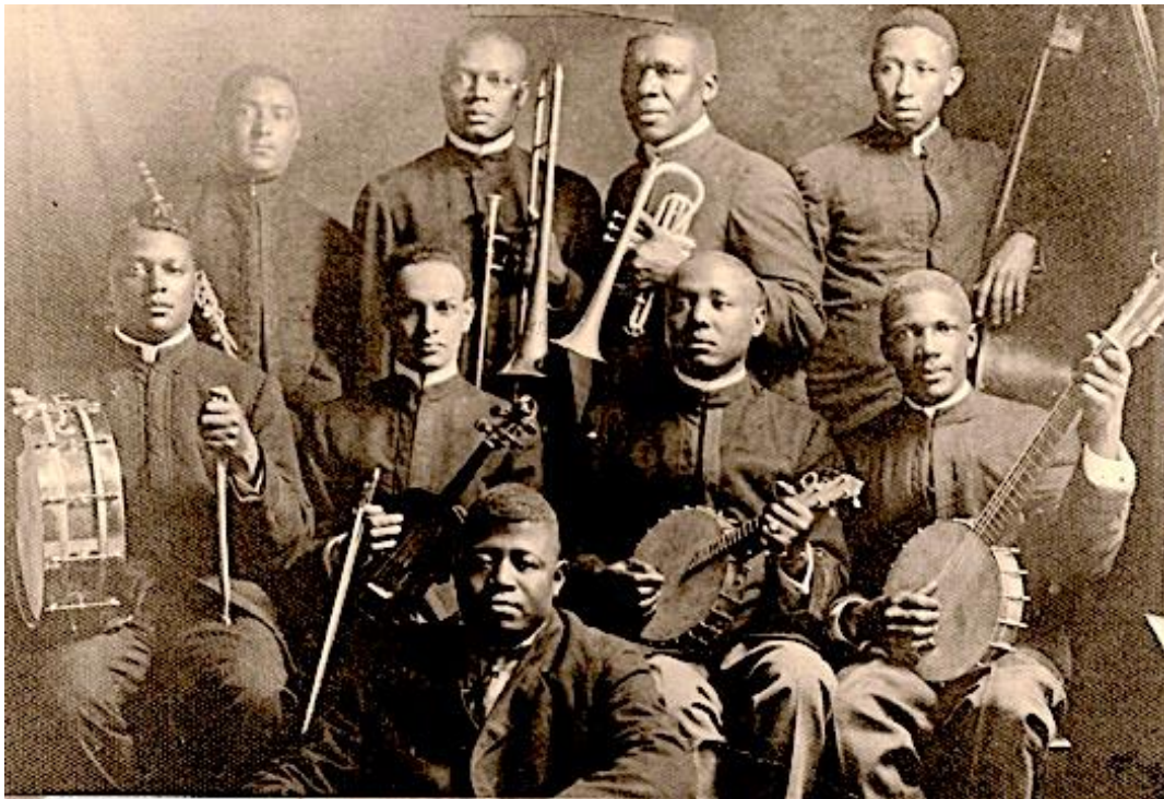
The Tuxedo Jazz Band, photographed in 1914