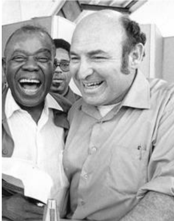
Louis Armstrong and George Wein at the Newport Jazz Festival, 1970