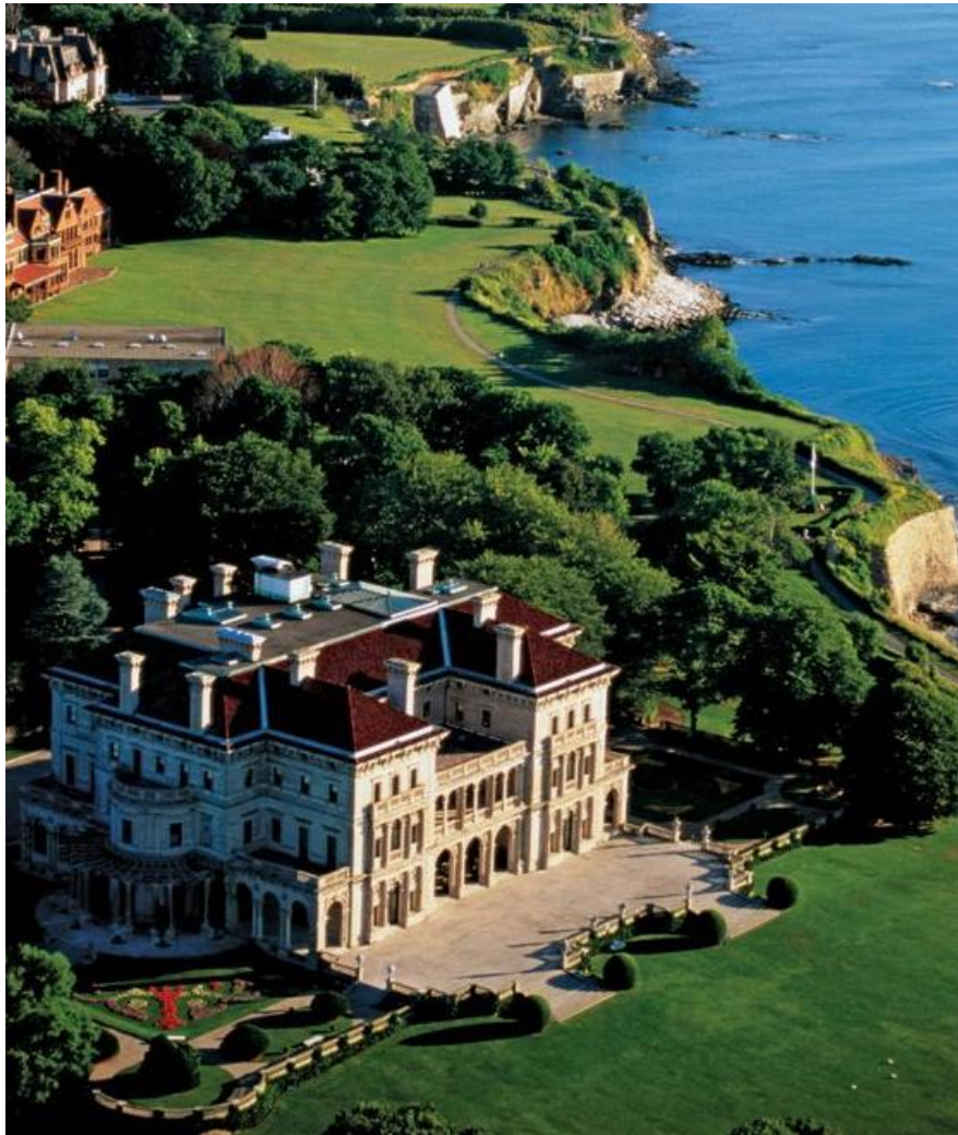
Cornelius Vanderbilt II's summer residence, "The Breakers", built in just two years (1893-1895) at a cost of over 7 million dollars (equivalent to over $150 million today)

"Chateau-sur-Mer". Yankee traders were soon followed by the richest families in America. The Astors and Vanderbilts had to have their "cottages", too, during the nation's "Gilded Age". For Cornelius Vanderbilt II, it was "The Breakers", completed in 1895 overlooking Newport's seagirt cliffs.