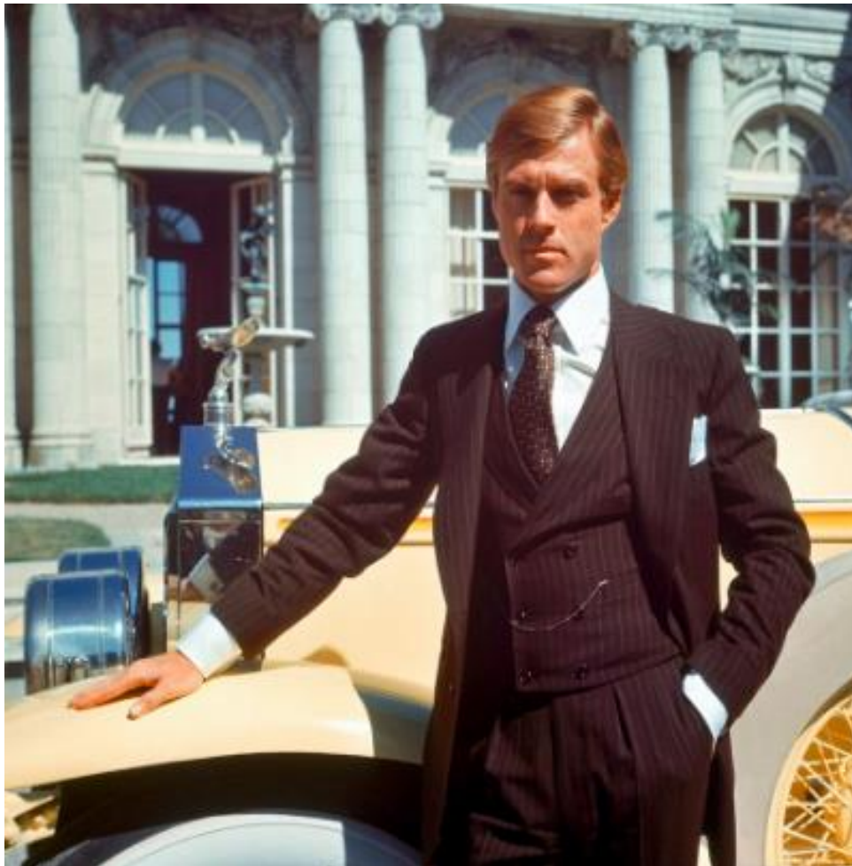
Robert Redford as Jay Gatsby in front of "Rosecliff" in the 1974 film