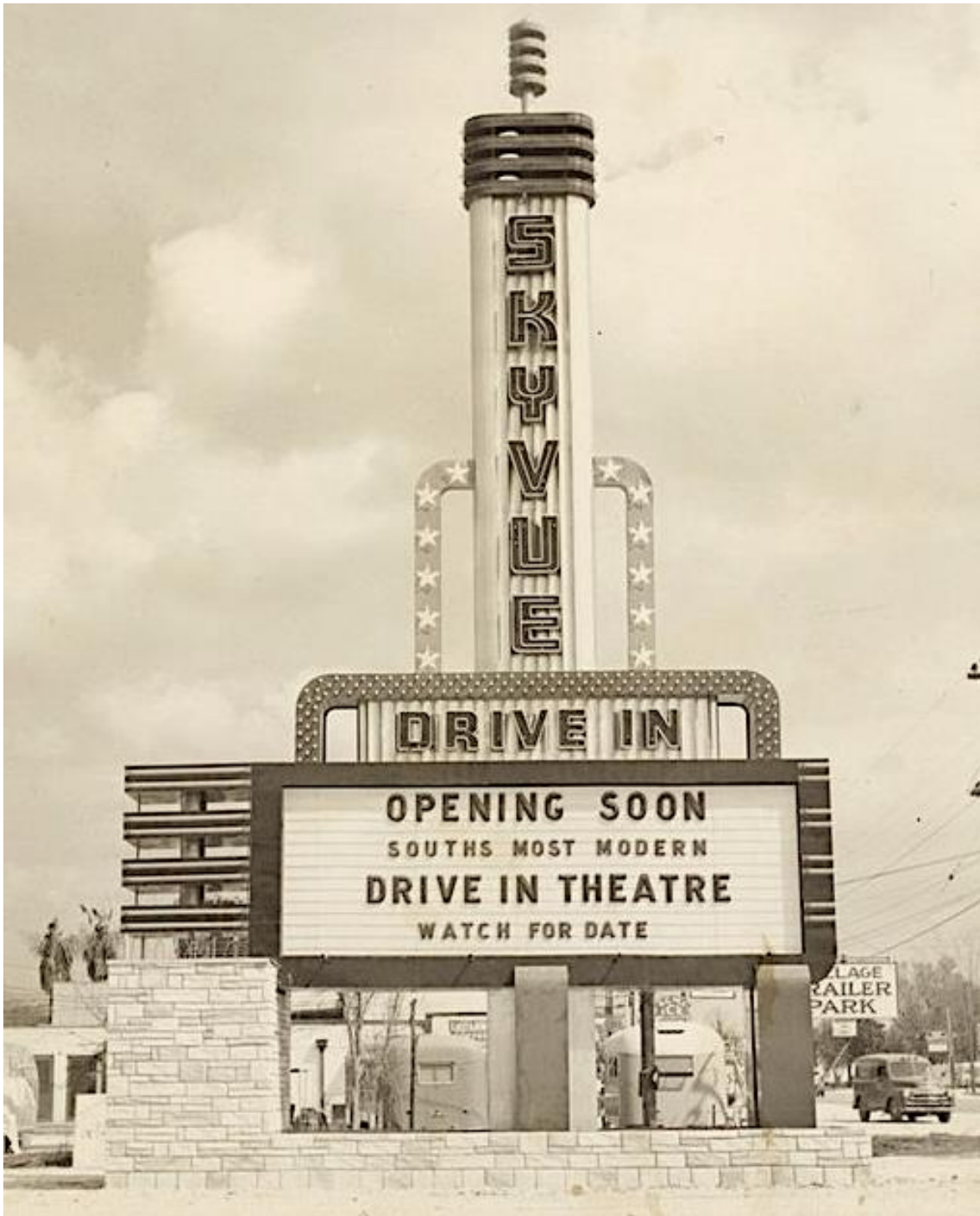
The Skyvue Drive-In opened March 9, 1951 at 5947 Chef Mentour Highway (formerly Gentilly Highway).

"The movie wasn't so hot, it didn't have much of a plot We fell asleep, our goose is cooked, our reputation is shot"