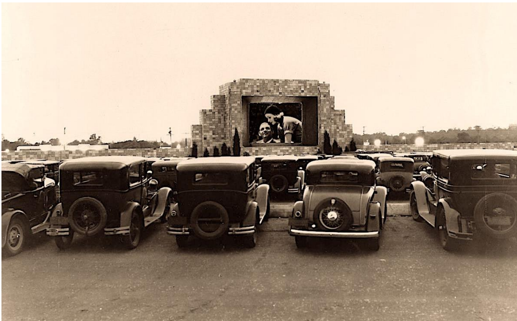
The very first drive-in, Pennsauken, New Jersey, 1933