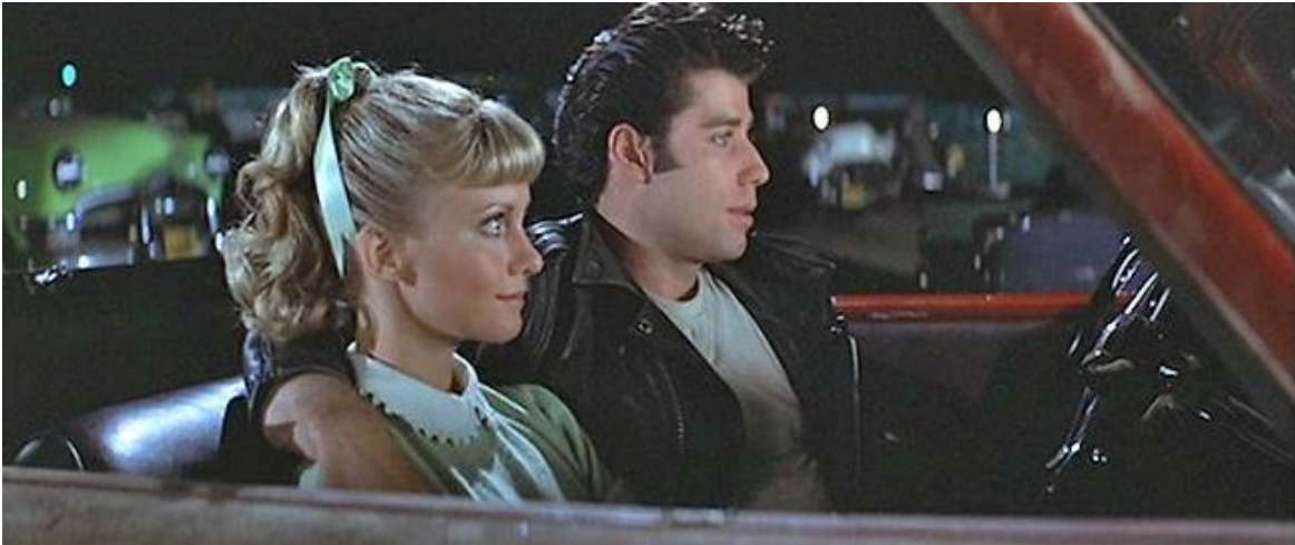
Olivia Newton-John and John Travolta at the drive-in in "Grease"

"Unsteamed windows" were a real problem for this conflicted ingénue . And if you were in the greater New Orleans area, "Pic" coils were available from the concession stands to repel another variety of neck feeders, the mosquitoes.