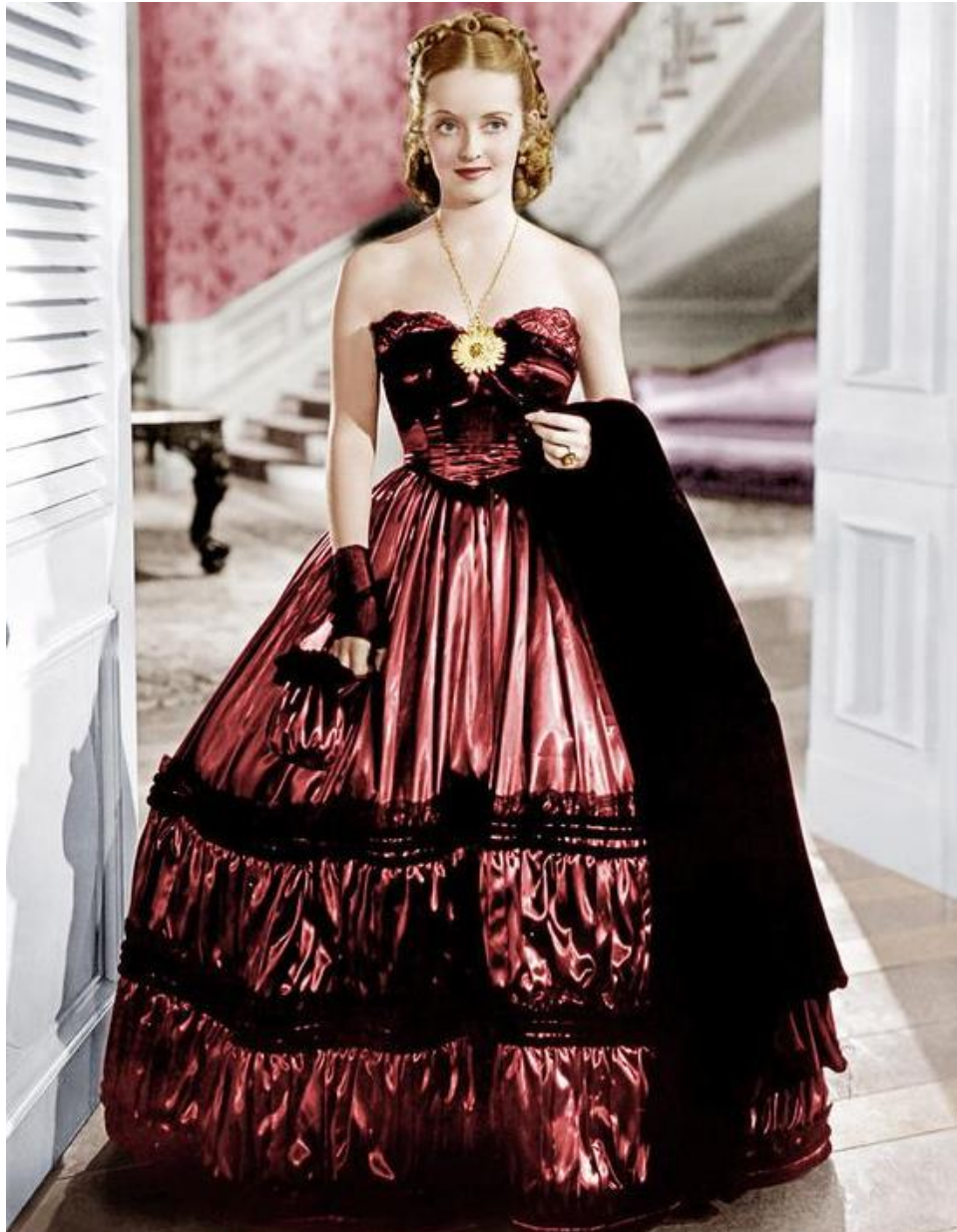
Julie Marsden, the Jezebel in her scandalous red dress

Julie is upset that Pres has kept her waiting in her carriage outside the bank, although she is confident that she has him trained and obedient to her will: "I've been trainin' him for years," she brags.