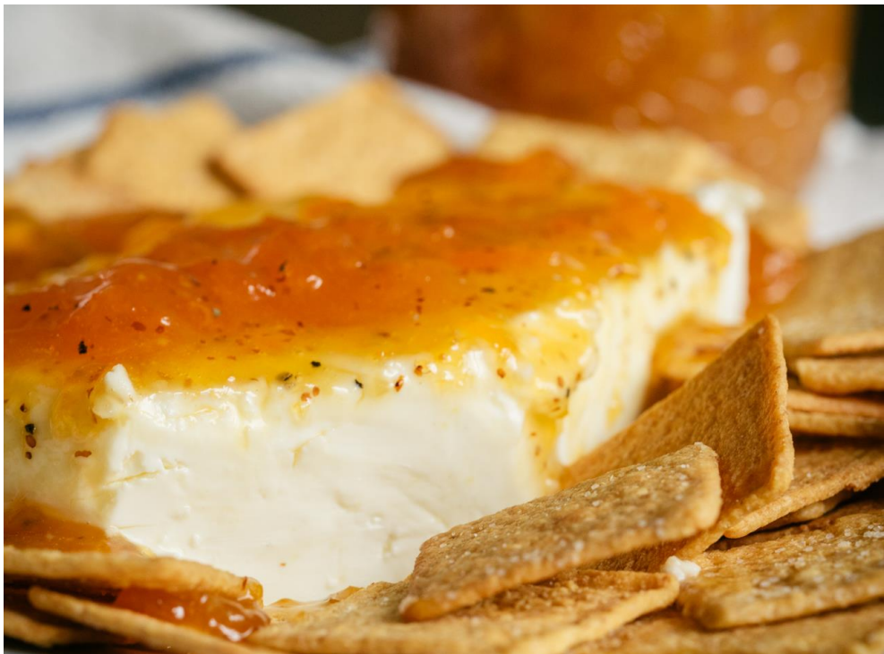
Jezebel Sauce over Philadelphia Cream Cheese, with crackers

And then there's Jezebel Sauce. One might find it odd that a sauce is named after a headstrong woman in the Old Testament who was defenestrated and consequently eaten by dogs. Jezebel, a Phoenician queen, was as an assertive woman vilified for thousands of years because she did not let men dominate her. It was for this trait that a popular 1938 American dramatic film was entitled Jezebel . Perhaps the sauce was named "Jezebel" for being (like the headstrong New Orleans woman in the film) assertive, as well.