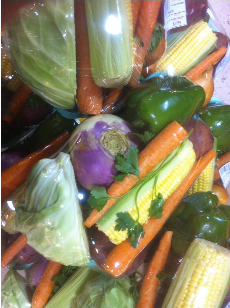
Soup bunches, as can be found at New Orleans supermarkets