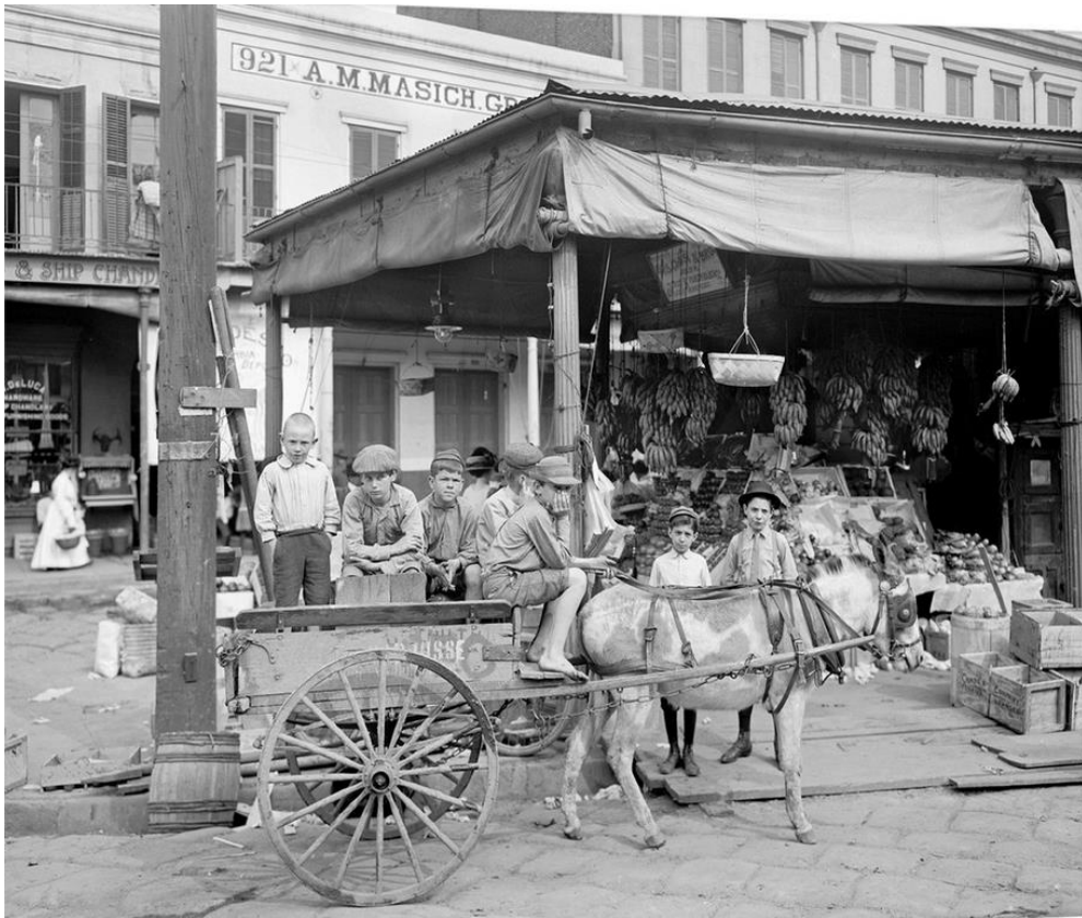
French Market in New Orleans

Alternatively called a "soup pack" by some, the oldest written mention of the phrase appears to be in an 1883 article from the St. Louis Post Dispatch entitled "Hermann and the Hucksters". Hermann approaches an "ample matron" at a "vegetable dealer's stall" and asks, "How do you sell these soup bunches?" "After picking up a peck measure full of herbs," Hermann received her reply. "Two cents a piece," she said. Things were a lot cheaper back then.