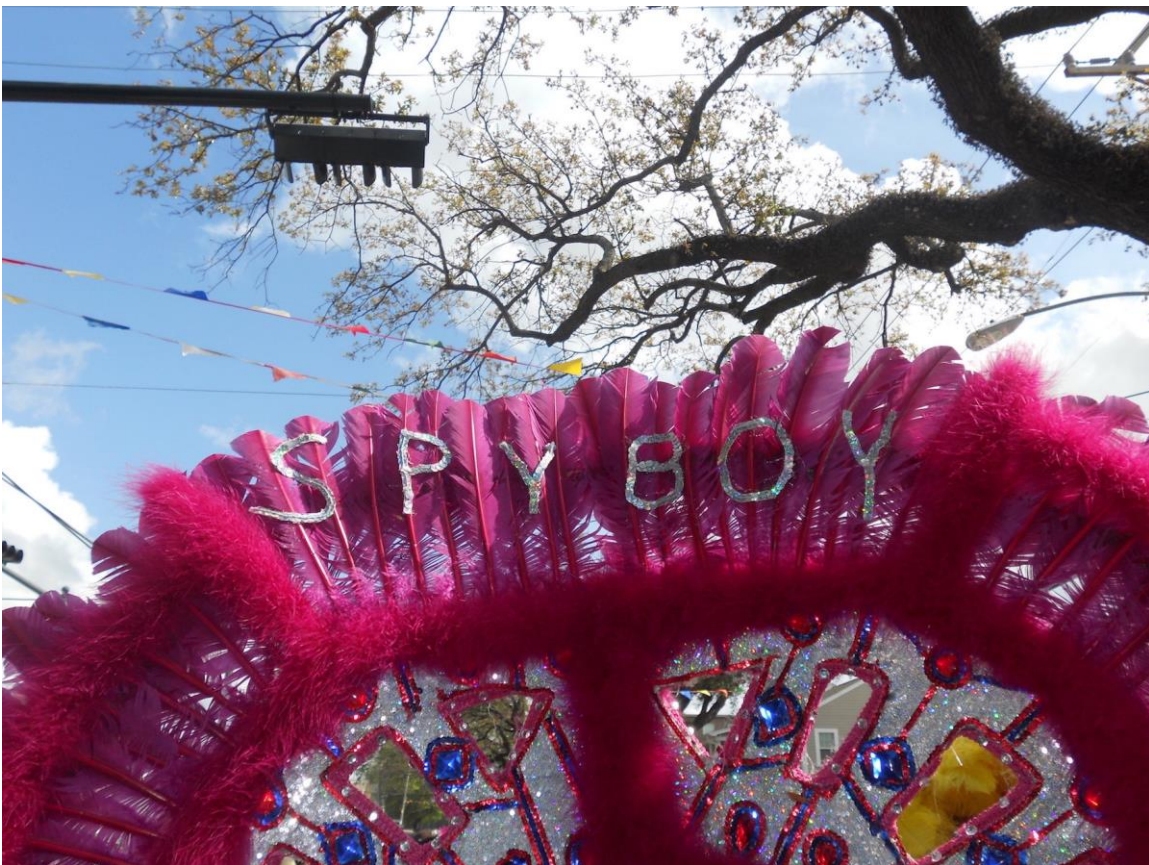
Detail on colorful "Spy Boy" Mardi Gras Indian headdress

As a young man Dupree became a traveling man, a wayward minstrel off to Chicago and Indianapolis, always playing piano while working on the side as a cook or an assortment of other odd jobs. In Detroit he met the great Joe Louis, who encouraged him to become a boxer. He ultimately fought in 107 bouts, winning many championships and picking up the nickname "Champion Jack", which the famed American blues pianist used the rest of his life.