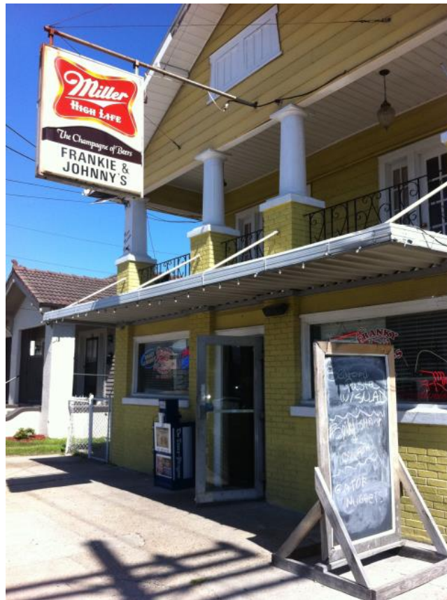
Frankie & Johnny's on Arabella and Tchoupitoulas

To others in the Crescent City, it's a wonderful seafood restaurant known as Frankie and Johnny's at 321 Arabella Street, corner Tchoupitoulas, which specializes in po-boys and some great fried seafood.