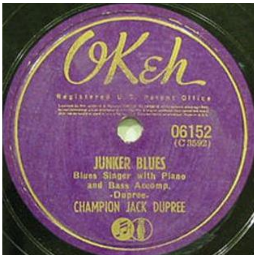
"Champion Jack" Dupree's Junker Blues

And to some old timers and serious music aficionados, it's "Champion Jack" Dupree's Rampart and Dumaine , his unique take on Frankie and Johnny . "Champion Jack" Dupree also recorded the song Yellow Pocahontas about his early days as a "spy boy".