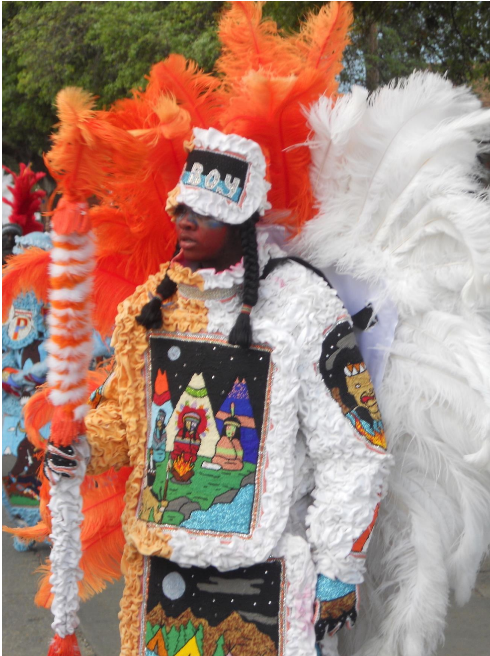
Mardi Gras Indian "Spy Boy" in all his finery

refashioned into his first hit, The Fat Man ). Sometimes Dupree would indulge in the jive hipsters' word play known as "Vout", as in his Mr. Dupree Blues . And often he sang light-hearted tunes like the Dupree Shake Dance : "Come on, mama, on your hands and knees, do that shake dance as you please". Although Jerry Lee Lewis did not record Dupree's Shake Baby Shake , the lyrics of Whole Lotta Shakin' Goin' On - "You can shake it one time for me!" - echo Dupree's words.