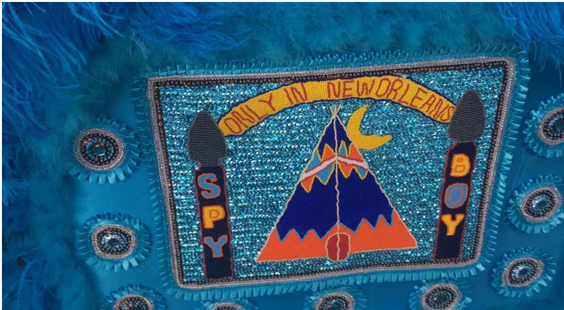
"Spy Boy" beadwork on Mardi Gras Indian "suit" – not costume!

"My spy boy saw your spy boy, sittin' by the bayou (or, sometimes, by the 'fi-yo', i.e., 'fire'). My spy boy told your spy boy, "I'm gonna set your flag on fi-yo'."