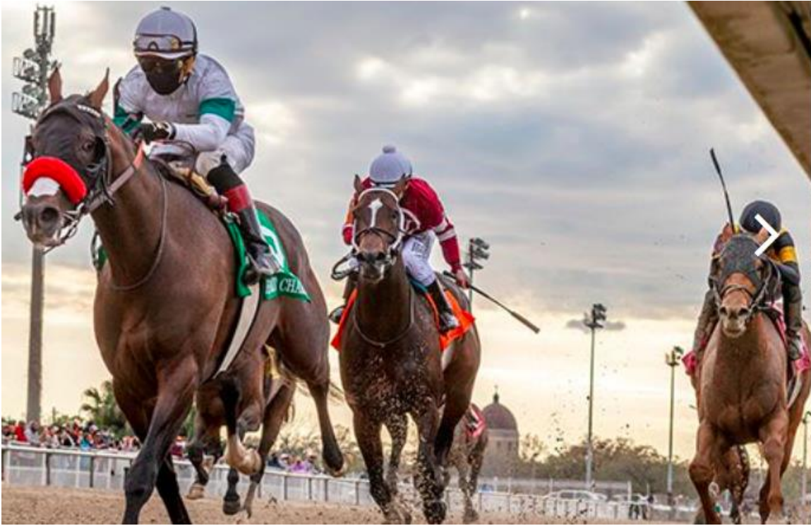
The Fair Grounds, with Our Lady of the Rosary in the background