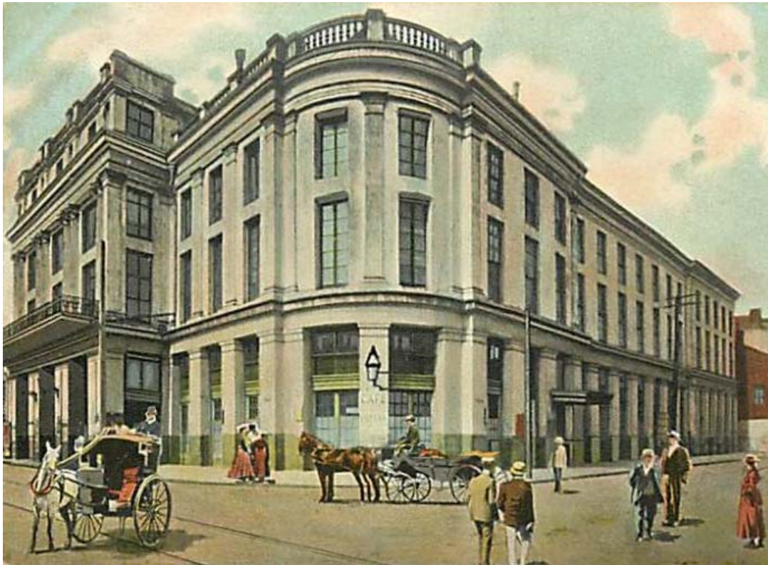
The French Opera House before it was destroyed by fire in 1919

The French Opera House was another famous building he rescued.