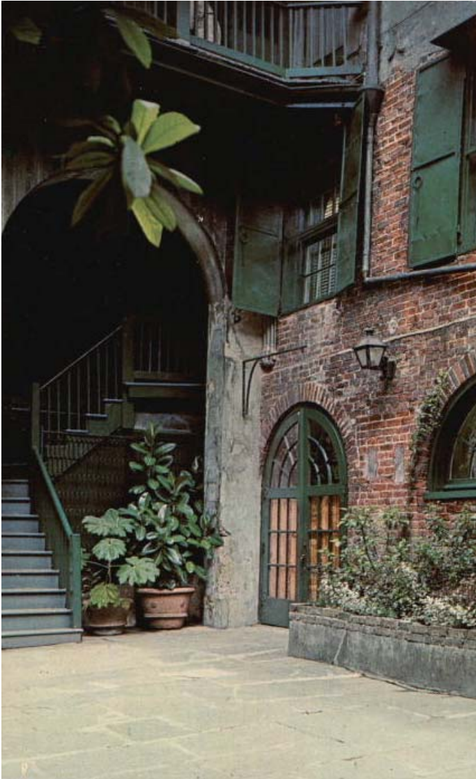
The beautiful Brulatour Courtyard