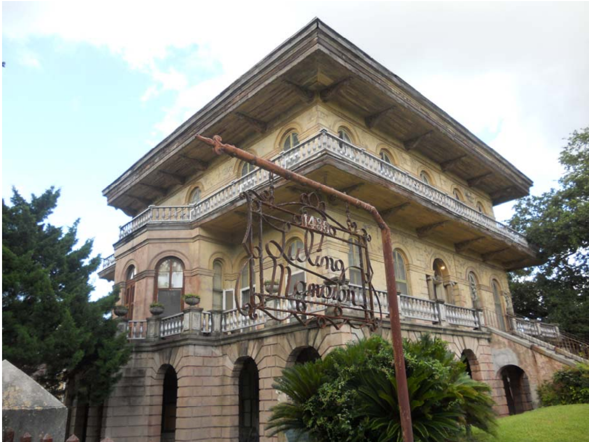
The Luling Mansion in 2012