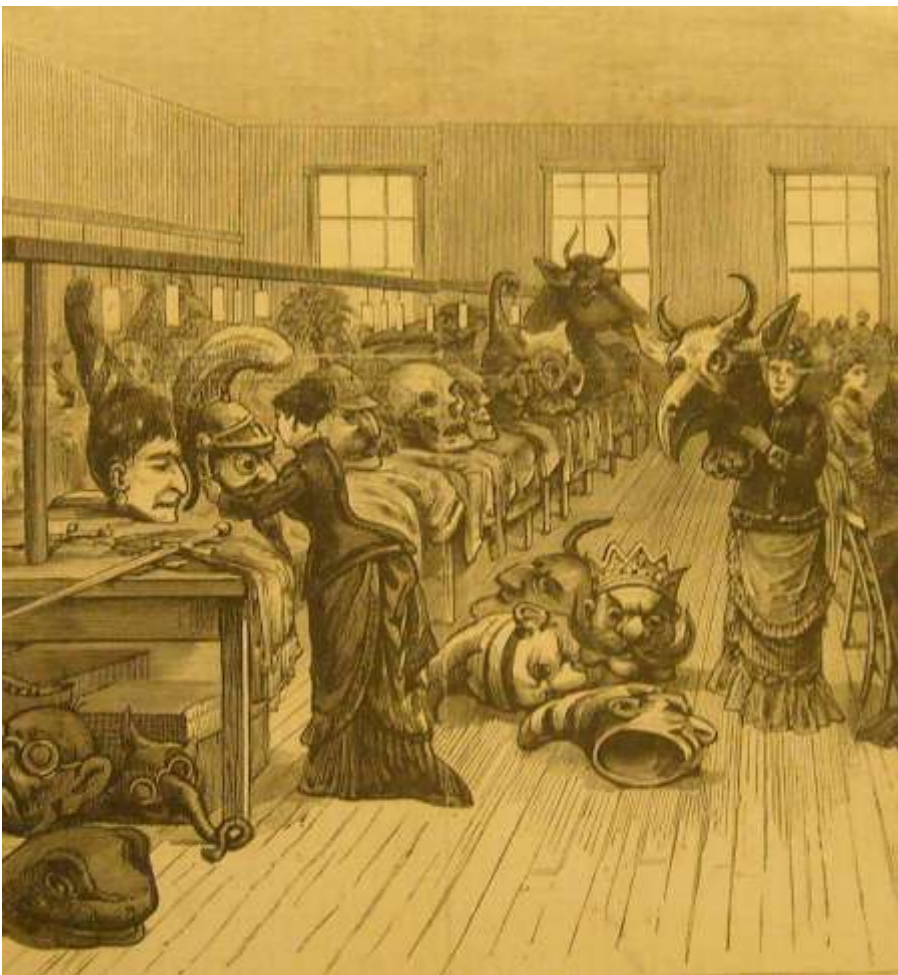
A New Orleans "Costume Depot" on Camp Street

Dominoes (the masked costume variety) were advertised in the New Orleans Daily Picayune , November 1, 1855, page 2, column 5. Madame Fierobe of "112 Conti street," the ad stated, "has lately very largely increased her extensive and varied assortment of costumes, dominoes, masks, ... so that she can now supply them appropriate for the representation of every nation, age and style. As heretofore her prices will be found very moderate. See advertisement."