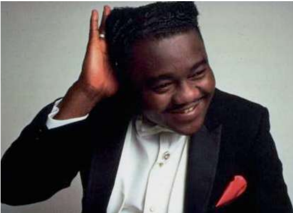
A dapper Antoine Dominique "Fats" Domino, Jr. (February 26, 1928 – October 24, 2017) earlier in his career

With producer and arranger Dave Bartholomew, "Fats" helped put his hometown on the rock 'n' roll map. This shy lifelong New Orleanian influenced numerous artists including Paul McCartney and Randy Newman, who once confessed, "I was so influenced by Fats Domino that it's still hard for me to write a song that's not a New Orleans shuffle." Domino's distinctive barreling triplet-based piano style, backed by a solid backbeat, was something exceptional, a step above traditional rhythm and blues. And his performing style was infectious, seated at his piano facing sideways to the crowd, revealing a beaming smile as he sang and played. With an endearing persona, and performing music popular among young and old alike, "Fats" played a pivotal role in breaking down the musical color barrier, especially between black and white teenagers. We'll miss you, Fats.