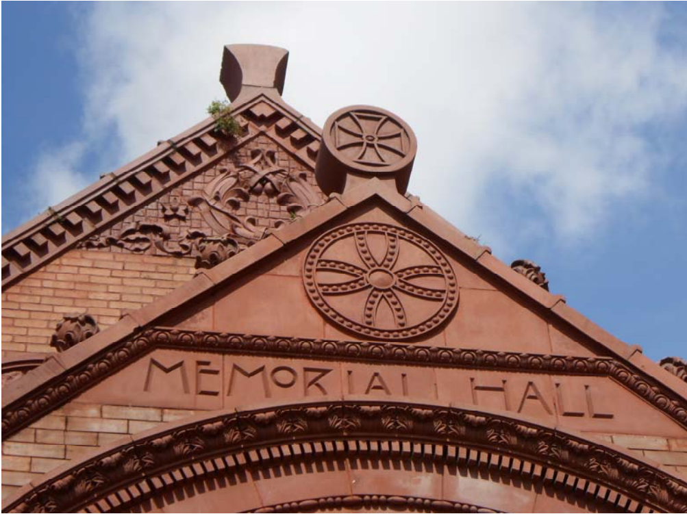
Section above the entrance to Memorial Hall, the Confederate Museum at 929 Camp Street in New Orleans

contains perhaps the finest collection of Confederate archives and mementoes in the South." "In this building," Memorial Hall, they wrote "are the private and state papers of President Davis."