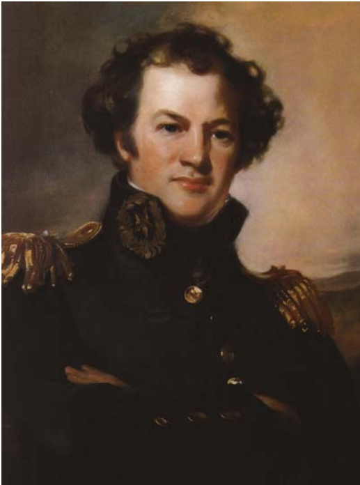
Alexander Macomb and the fort that bears his name (old postcard view).

Fort Macomb's walls are forty feet thick, and the roof is many feet deep with turf. There is a moat surrounding this fort, with a drawbridge to give entrance. Both forts were built to defend New Orleans, but neither saw battle (even through the Civil War). Union troops re-took the fort after the capture of New Orleans, but not before the Confederate soldiers destroyed the guns and burned the wooden structures.